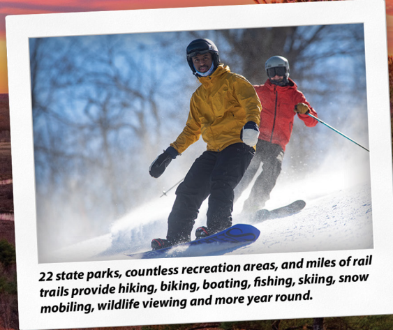
22 state parks, countless recreation areas, and miles of rail trails provide hiking, biking, boating, fishing, skiing, snowmobiling, wildlife viewing and more year round.