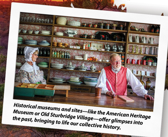
Historical museums and sites—like the American Heritage Museum or Old Sturbridge Village—offer glimpses into the past, bringing to life our collective history.