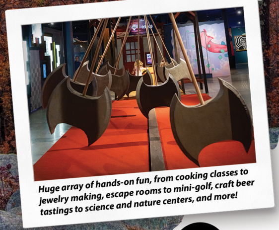
Huge array of hands-on fun, from cooking classes to jewelry making, escape rooms to mini-golf, craft beer tastings to science and nature centers, and more!