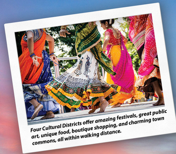
Four Cultural Districts offer amazing festivals, great public art, unique food, boutique shopping, and charming town commons, all within walking distance.

Epic group trips to Massachusetts start here