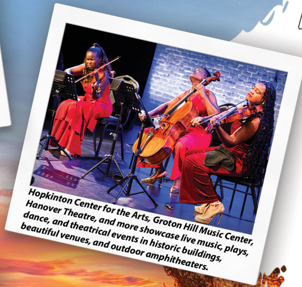
Hopkinton Center for the Arts, Groton Hill Music Center, Hanover Theatre, and more showcase live music, plays, dance, and theatrical events in historic buildings, beautiful venues, and outdoor amphitheatres.